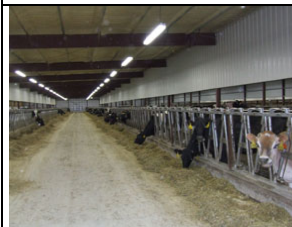
Feed Alley in Mechanical Ventilation Barn