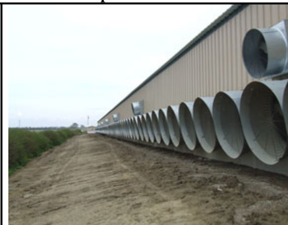
Mechanical Ventilation Freestall Barn