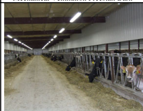
Feed Alley in Mechanical Ventilation Barn