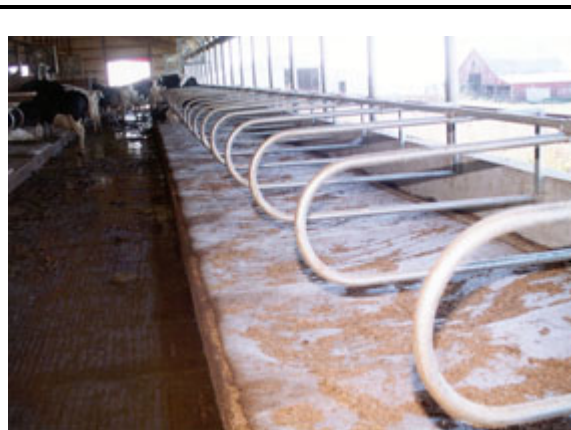
Mattress Freestall System