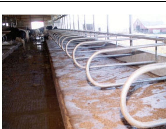
Mattress Freestall System