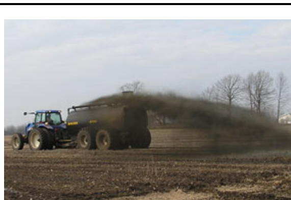
Tractor-Pulled Liquid Manure Spreader