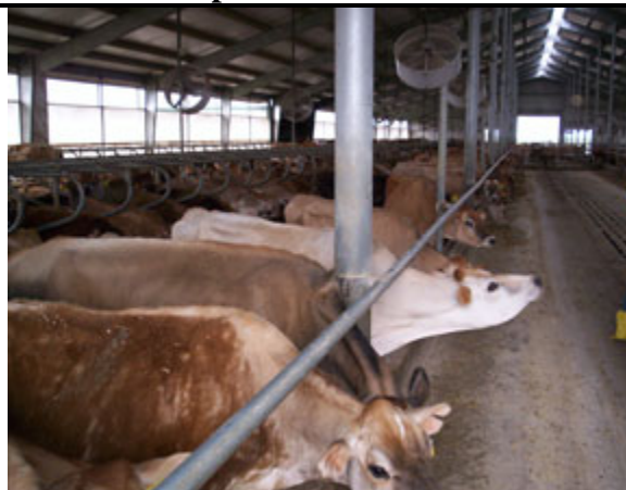
Slatted Floor System with Natural Ventilation