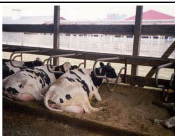
Sand Bedded Freestall System