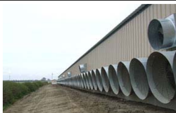
Mechanical Ventilation Freestall Barn