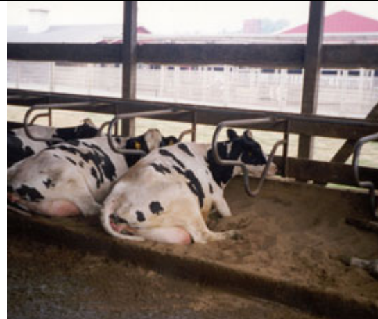
Sand Bedded Freestall System