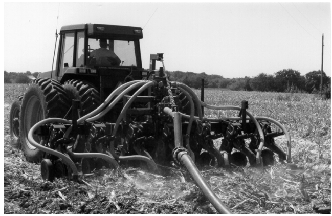
Figure 2. Injecting manure as a fertilizer for crop production.

Biological oxygen demand (BOD) is a measure of the amount of oxygen required to degrade organic matter in water. One major objective of domestic